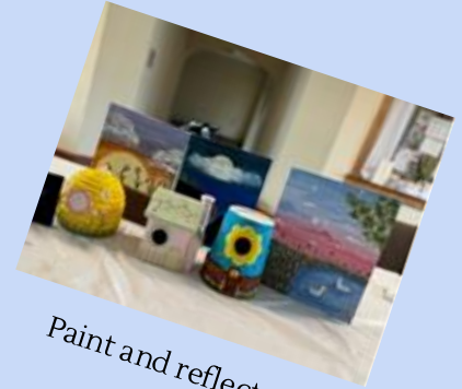
Paint and reflect