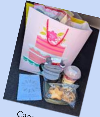
Care packages for elderly